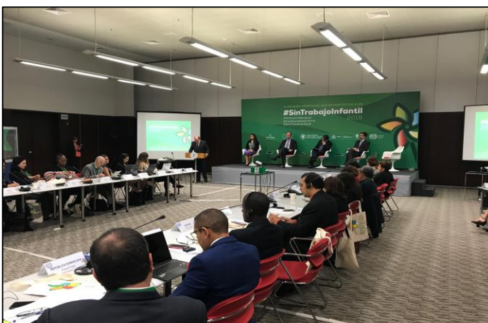
Meeting of the Regional Initiative for Latin America and the Caribbean Free of Child Labour.

From 2014 to 2017, the Regional Initiative’s role in information and knowledge generation and in facilitating targeted exchanges and collaboration between governments, workers, the