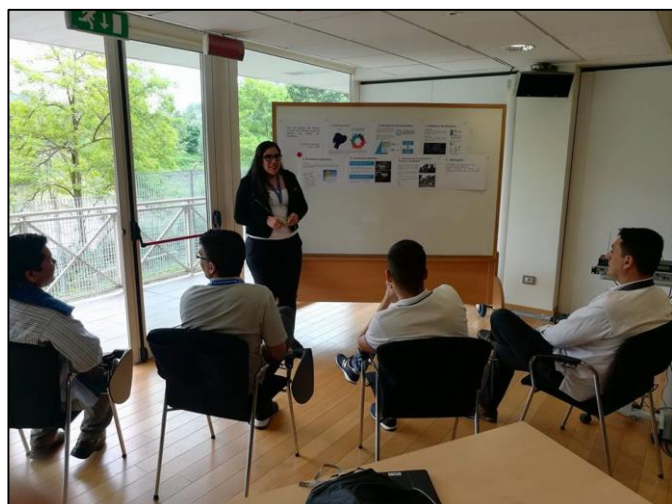
Disaster Risk Reduction and Sustainable Local Development Training Course, ITC Turin, 2018.

The role of ITC-ILO and PARDEV/SSTC in this programme was to enrich South-South cooperation, providing the participants in the programme with high quality training inputs on local development and DRR-related topics; supporting participants to develop articles on successful policies and practices in their respective countries; and supporting the knowledge sharing platform and network of practitioners. Past experience in the programme has showed strong evidence of the existence of a solid network of policy makers and practitioners providing mutual support on topics of common interest, the creation of a growing knowledge base on successful policies and practices at the disposal of the network of practitioners, and the adoption of successful policies and practices in the different countries as a result of participants' active participation in the training programme and the network of practitioners.