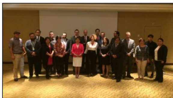
Network meeting in Geneva, September 2018.

In 2018, country profiles were established which document the laws, policies and institutions set up by the countries in the Latin American region that have ratified Convention No. 169. The profiles are currently being technically reviewed and also shared with participating