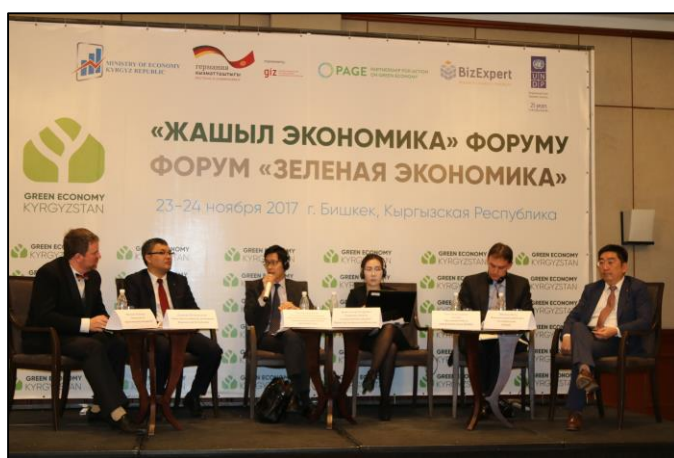
Exchanges between Kyrgyzstan and Mongolia during PAGE Week, Mongolia, 2017.

Towards a solution: South-South and triangular cooperation between Kyrgyzstan and Mongolia provides an opportunity to build and strengthen mutual exchanges on green economy policy development and practice between the two neighbouring countries, which is