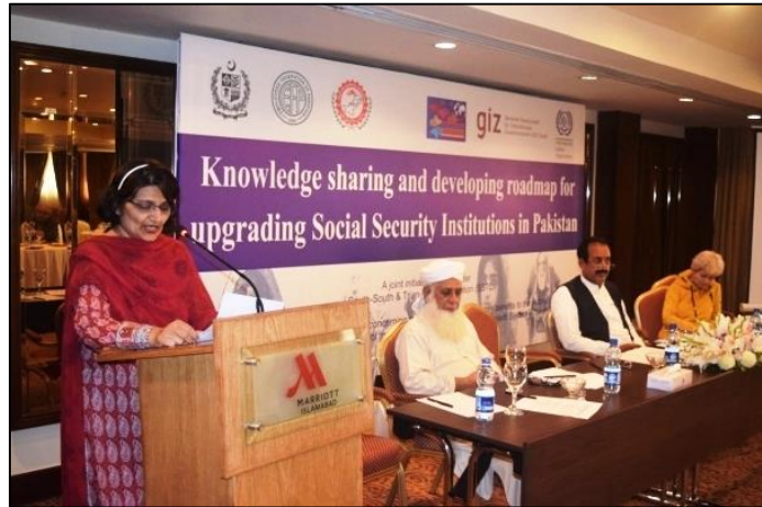
Knowledge sharing workshop on upgrading Social Security Institution in Pakistan.

It covered only a fraction of formal economy workers. In addition, delivery of benefits was delayed due to use of manual systems (i.e. not computerized). The ILO has been working with the Khyber Pakhtunkhwa Province to pilot a One Window Operation for various social protection benefits in two districts, and a technical cooperation project was launched in Sindh to support primarily the