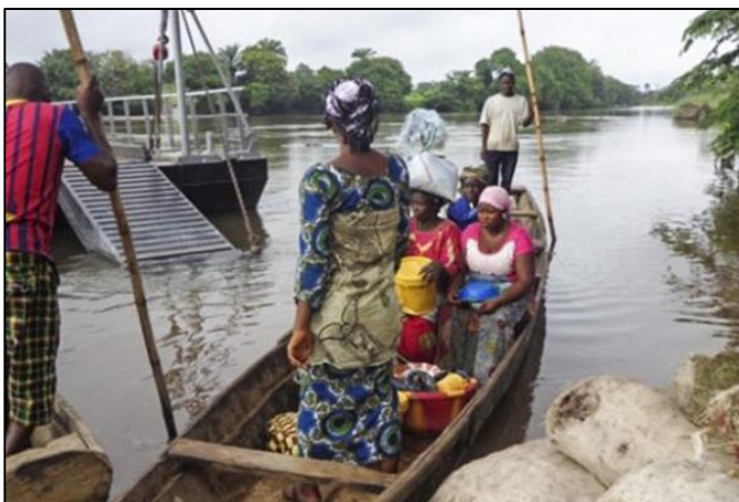
Women in cross-border trade within the Mano River Union (MRU).

Challenges: Women in Sierra Leone, and particularly women entrepreneurs, continue to face a number of challenges such as low literacy levels, lack of business and technical skills, limited access to business development and financial services, and limited access to profitable markets, including difficulties in accessing outside markets through cross-border trade with neighbouring countries, notably Liberia, Guinea and Côte d'Ivoire, which are also fragile states and members of the Mano River Union (MRU). The East African Community (EAC) women cross-traders face similar challenges, but have developed a simplified guide on customs tariffs and immigration procedures to facilitate trade