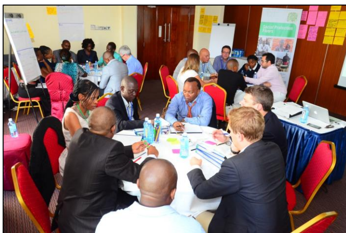
TRANSFORM training.

Challenges: Despite some success stories and champion countries, sub-Saharan Africa remains the region with the world's lowest social protection coverage. 5 The challenges include a lack of technical skills and awareness among African civil servants at all levels of successful pathways towards universal social protection coverage. There is a lack of capacity for operational and administrative processes for the successful governance and implementation of social protection policies and programmes. This is also reflected in the discrepancy between the rights-based aspirations often articulated in national legislation, development plans and social protection strategies, and the weak performance of social protection systems and schemes in practice. While there is a wealth of experience in Africa, there is no systematic harvesting of such experience, and no African curricula or learning opportunities to acquire technical or practical skills relevant to the African context. Yet social protection is paramount to achieving the 2030 Agenda, in particular its potential to deliver on the promise of leaving no-one behind. Social protection is explicitly included among the targets of the SDGs, and cuts across the five dimensions of people, prosperity, peace, planet, and partnerships.