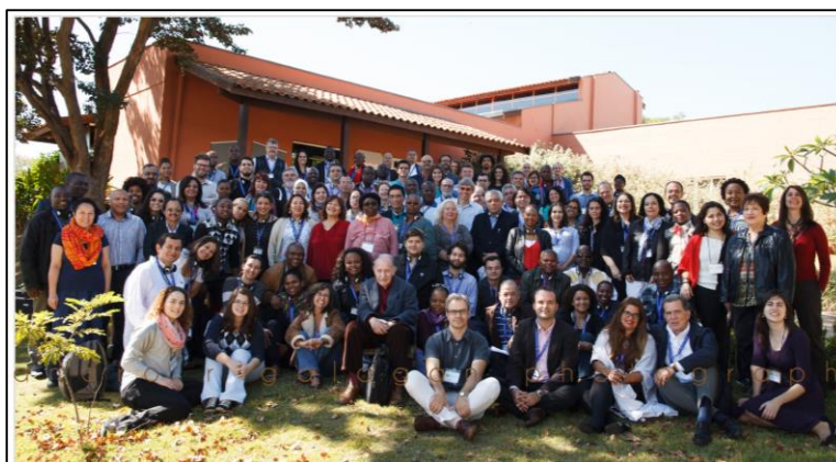
Social and Solidarity Economy Meeting, Campinas, 2014.

The ILO SSE Academy enjoyed the presence of participants from the Global South, thanks to scholarships funded by the ILO's SSTC programme. Covering travel, accommodation and participation fees to the Academy, the scholarships allowed selected individuals to attend the