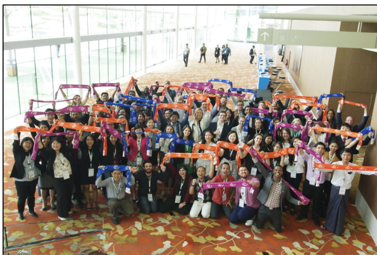
Youth Champions at SafeYouth@Work.

strategy of the SafeYouth@Work Project, action is organized in five priority areas: compliance; data and research; education and training; advocacy; and networks. The Action Plan provides a framework for collaboration and cooperation among all interested parties and South-South exchanges to promote safe and secure working environments for