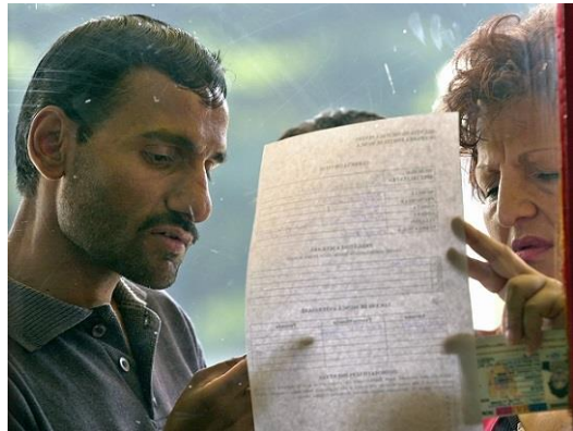
Exchanges during the peer learning event among Western Balkans countries on employment policies.

The project helped secure more practical support by government for disadvantaged groups and contributed to the realization of SDG 8 on decent work and inclusive growth. The project brought together public employment agency staff from five countries for a peer learning exchange which facilitated the knowledge and experiment sharing, expert guidance, and support from peers who have learnt from their failures and successes. This cross-country transfer of good practices among countries in the region ensured that no country would have to address the development challenges alone. The ILO first helped