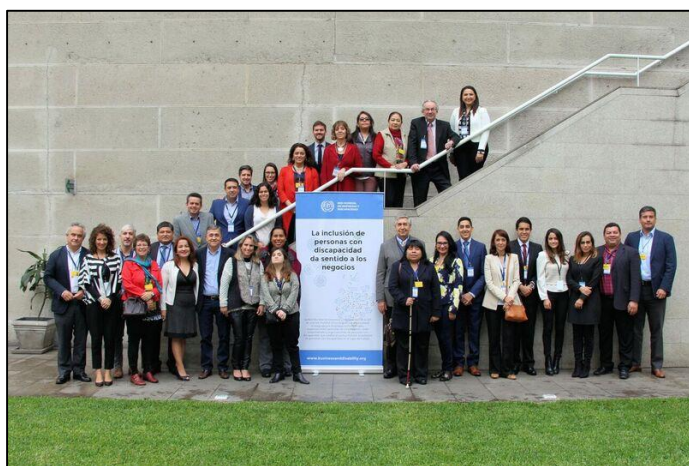
Global Business and Disability Network Workshop, Peru 2017.

Towards a solution: The ILO Global Business and Disability Network (GBDN) is a unique employers-led network of more than 25 global companies, more than 20 National Business and Disability Networks (NBDNs), and eight non-business organizations working in collaboration to promote the inclusion of persons with disabilities in the workplace. Often in collaboration with the GBDN, private enterprises that employ persons with disabilities increasingly join forces by creating NBDNs with a view to establishing regional and sub-regional business and disability networks to provide peer-to-peer support, share knowledge, develop joint tools and products, and organize meetings and events. Such NBDNs serve as inspiration for good policies and practices not only for their members, but also for the wider business community. NBDNs are instrumental in increasing companies' awareness of disability issues and of the business benefits of inclusion, and in preparing companies to welcome and retain staff with disabilities.